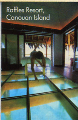
Raffles Resort, Canouan Island

Top service: The RafflesAmrita Spa's Couples Wellness Journey includes steam baths, facials, and massages in a glass-bottom sea palapa, accessible only by boat. Rooms start at $475; canouan.raffles.com