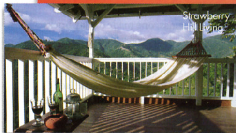
Strawberry Hill Living